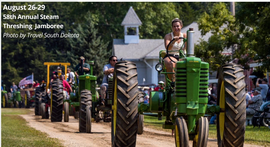
August 26-29 58th Annual Steam Threshing Jamboree

JULY 27-31 Butte-Lawrence County Fair Nisland, SD, 605-484-8709